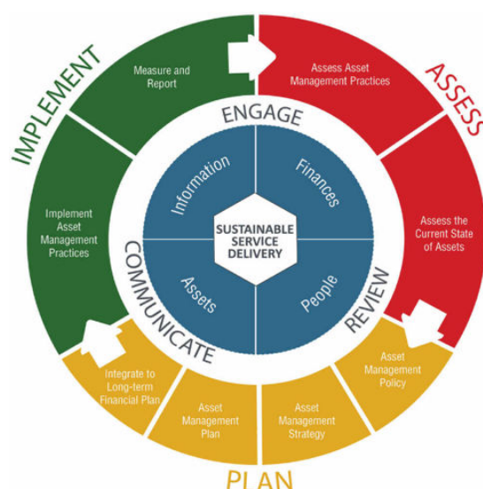
Figure 2 A framework for asset management, showing its different aspects ( https://www.assetmanagementbc.ca/framework/ )