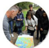
Tell the Stories

Maps, artifacts, images, mixed and augmented reality