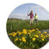
Engage with the Public

People and the relationship with nature, bring in societal value by raising awareness for protection of our present and future landscapes and its bio-cultural diversity