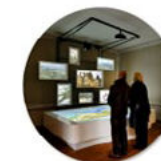
Visualize our History

Maps, artifacts, images, mixed and augmented reality