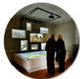
Visualize our History

Maps, artifacts, images, mixed and augmented reality