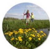
Engage with the Public

People and the relationship with nature, bring in societal value by raising awareness for protection of our present and future landscapes and its bio-cultural diversity.