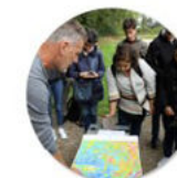
Tell the Stories

Maps, artifacts, images, mixed and augmented reality