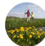
Engage with the Public Raise awareness and spark conversation