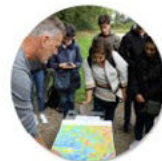
Tell the Stories

Maps, artifacts, images, mixed and augmented reality