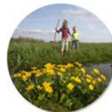
Engage with the Public

People and the relationship with nature, bring in societal value by raising awareness for protection of our present and future landscapes and its bio-cultural diversity