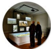
Visualize our History

Maps, artifacts, images, mixed and augmented reality