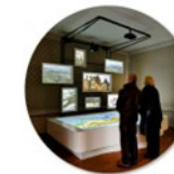
Visualize our History

Maps, artifacts, images, mixed and augmented reality