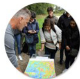
Tell the Stories

Maps, artifacts, images, mixed and augmented reality