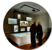
Visualize our History

Maps, artifacts, images, mixed and augmented reality