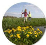
Engage with the Public

People and the relationship with nature, bring in societal value by raising awareness for protection of our present and future landscapes and its bio-cultural diversity