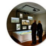
Visualize our History

Maps, artifacts, images, mixed and augmented reality