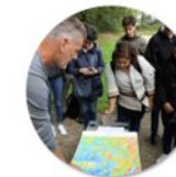
Tell the Stories

Maps, artifacts, images, mixed and augmented reality