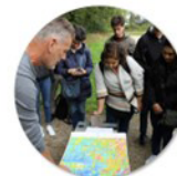
Tell the Stories

Maps, artifacts, images, mixed and augmented reality