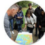
Tell the Stories

Maps, artifacts, images, mixed and augmented reality