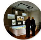
Visualize our History

Maps, artifacts, images, mixed and augmented reality