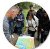
Tell the Stories

Maps, artifacts, images, mixed and augmented reality