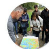
Tell the Stories

Maps, artifacts, images, mixed and augmented reality