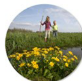
Engage with the Public

People and the relationship with nature, bring in societal value by raising awareness for protection of our present and future landscapes and its bio-cultural diversity