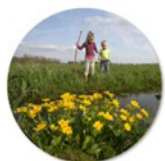
Engage with the Public

People and the relationship with nature. Bring in societal value by raising awareness for protection of our present and future landscapes and its bio-cultural diversity